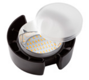
A silicone lens assists in diffusing both larger LED arrays and chip-on-board (COB) configurations.

Calculite's 2-step or 2SDCM rating provides uniformity of color quality and light levels from fixture to fixture with no shifts in CCT and hue. With Calculite LED generation 3, specifying uniform light and color consistency is achieved by leveraging Philips technology advancements. The combination of technologies; chip-on-board (COB) and single COB arrays allow designers to create the right layers of light to properly enhance a space per the design intent.