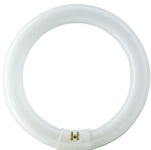
LPPR TL-E8 G10q