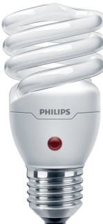
15W, E27 Automatic