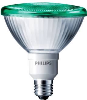
23W, Green, E26/E27