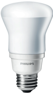
R20 13W E26