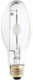
E26, ED-17, Clear