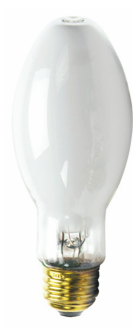
BD17 Medium Coated