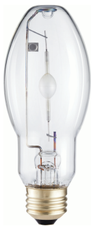
BD17, Med, CL, Elite