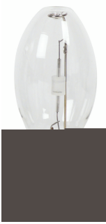
LPPR D-MHC-LW ED17 CL