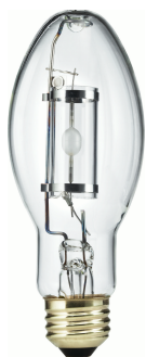
50 W Single Contact Medium Screw ED-17P Protected Clear CCT of 4000K