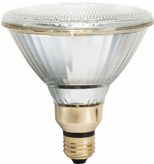
CDM PAR38 Medium Base