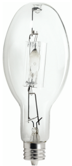
400 W Exclusionary Mogul Screw ED-37 Clear CCT of 3500K