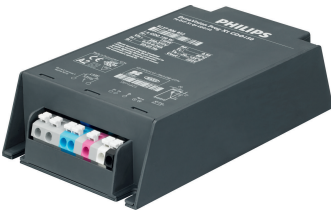
HID-DV DALI Prog Xt 150 CDO Q