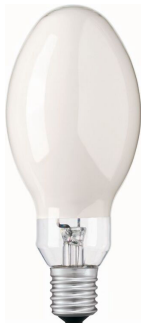
LPPR HPL 0002