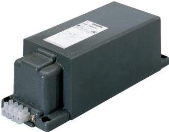
GPBR BSN-HP L02 L43 L78 PHL