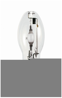
LPPR MH E26 E27 CL