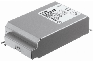
HID-PV C 150 /S CDM 220-240V 50/60Hz