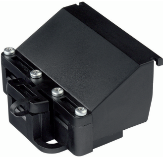
GPPR HIDSTRL1 PHL