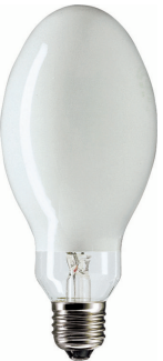
LPPR SON-PIA 0002