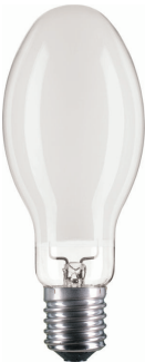
LPPR SON-PIA Plus E40