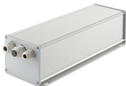
GearUnits - MASTER MHN-SA - 2000 W