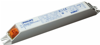
HF-M BLUE 124 LH TL/TL5/PLL 230-240V