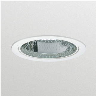
Latina FBH024 recessed downlight with fixed clear decorative glass cover