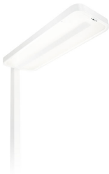
SmartBalance FFS DPP