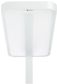
SmartBalance FFS DPP