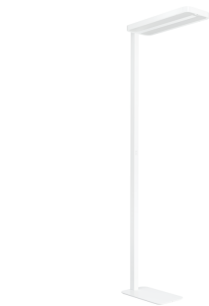
SmartBalance FFS DPP