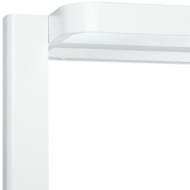
SmartBalance FFS DPP