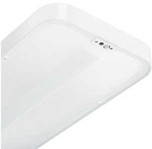
SmartBalance FFS DPP