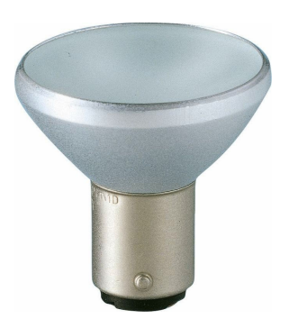
B15/BA15d R37 Frosted