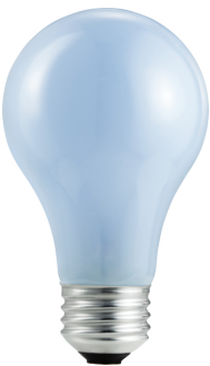
E26, T60, Daylight-Blue