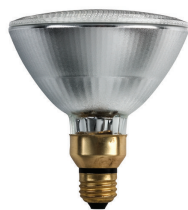
E26, PAR38, Flood