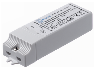
Certaline 60W 230-240V 50/60Hz