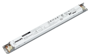
Lamp Driver, eFluo, HF-P 114-35 TL5 HE III 220-240V