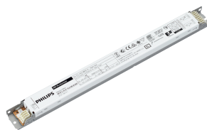
Lamp Driver, eFluo, HF-P 2 14-35 TL5 HE III 220-240V