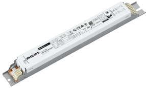
Lamp Driver, eFluo, HF-P 258 TL-D III 220-240V 50/60Hz IDC