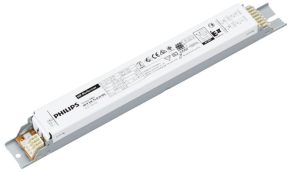
Lamp Driver, eFluo, HF-P 236 TL-D III 220-240V 50/60Hz IDC