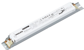
Lamp Driver, eFluo, HF-P 158 TL-D III 220-240V 50/60Hz IDC