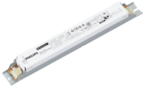
Lamp Driver, eFluo, HF-P 136 TL-D III 220-240V 50/60Hz IDC