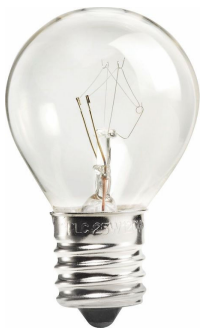
E17, S11, Clear