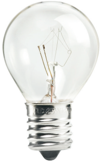
E17, S11, Clear