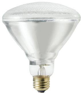
E26, BR38, Clear