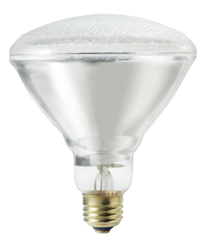
E26, BR38, Clear