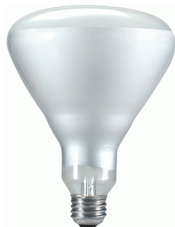
LPPR I-BR BR40 FL CL