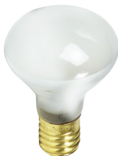
E17, R14, Frosted