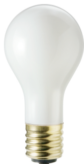
E39d, PS25, Soft White