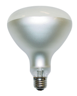
E26, R40, Flood