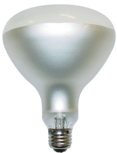
E26, R40, Flood