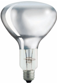
LPPR IRSG E27 R125 Clear