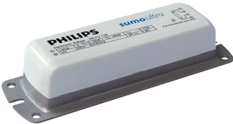
Sumo ultra 136