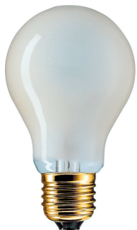
E27, A60/A65, Frosted