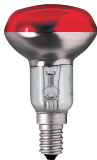
E14, NR50, Red