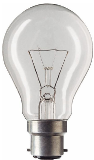
B22, A60, Clear