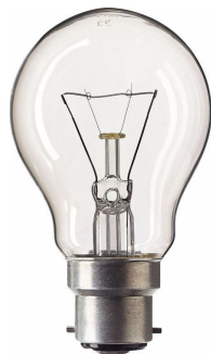
B22, A60, Clear