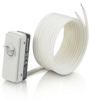
LRM8119/00 Lum Based Ext Sensor with LCA8004/00 COVER