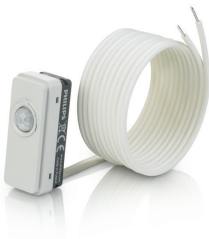
LRM8119/00 Lum Based Ext Sensor with LCA8004/00 COVER