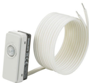
LRM8119/00 Lum Based Ext Sensor with LCA8004/00 COVER