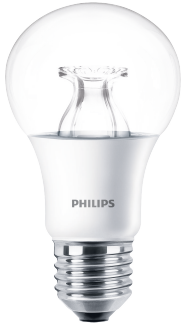
E27 A 60mm Clear