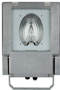
Facetted road-lighting POT optic