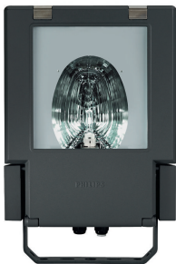
Facetted road-lighting POT optic