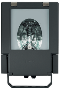
Facetted road-lighting POT optic