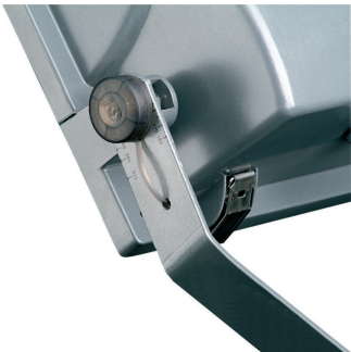
Protractor scale having degree intervals for easy adjustment and alignment