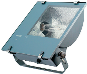
Tempo 3 RVP351 area flood-lighting luminaire