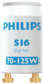
S16 70-125 W, WH