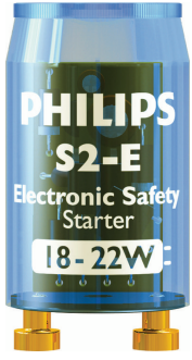
LPPR STARTER S2E BL PHL