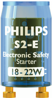
LPPR STARTER S2E BL PHL