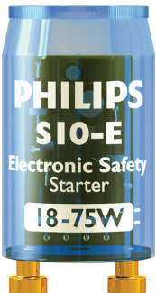
S10E, 18-75W, BL